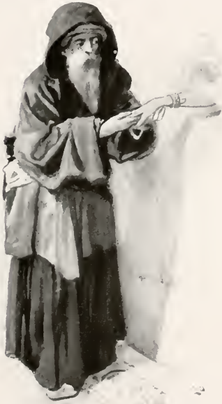
The slave slipped her hand through the opening (P. 46.)

After some conversation, in which Mustapha managed to give the impression that he was a very learned man, Thiuli said he would take this opportunity of having all his slaves examined and ascertain the state of their health. Mustapha was overjoyed